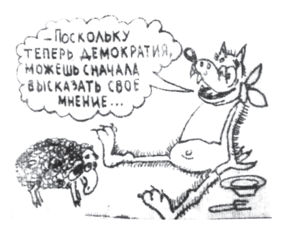
Wolf and Sheep. [The wolf is saying to the sheep, 'We've got democracy now, so by all means voice your opinion' – i.e., before I eat you.] Artist V. Zhabsky. Slovo. 6 November 1993

The authorities behaved wrongly. [...] Then the factory was closed and the machinery was sold when it changed from a kolkhoz to Agricultural Production Cooperatives. Now people